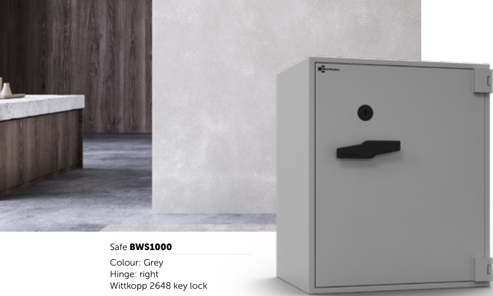
Safe BWS1000 Colour: Grey Hinge: right Wittkopp 2648 key lock