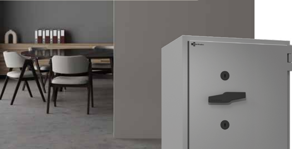
Safe EWS1000 Colour: Grey hinge: right 2 x key lock S&G