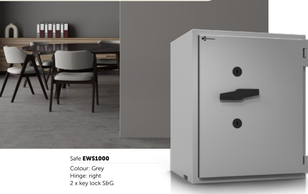
Safe EWS1000 Colour: Grey Hinge: right 2 x key lock S&G