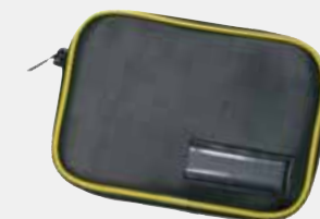
Fig. Throw-in bag