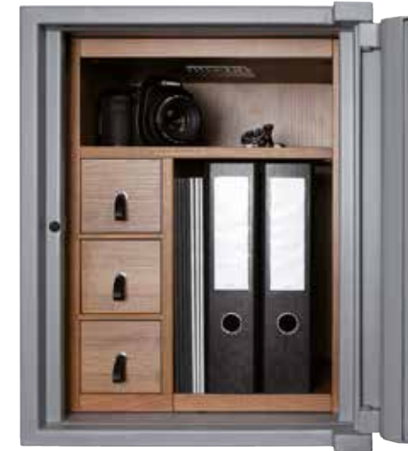
Fig. wooden fittings ALZ007200